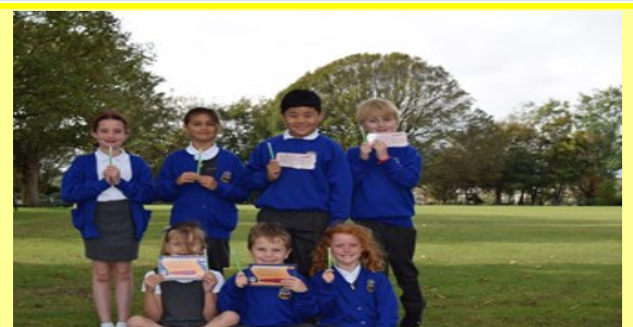
These Year 3 children have received their pen licenses, Congratulations!