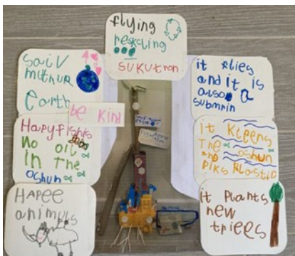
Early Years 2021 Winner Age 3-5