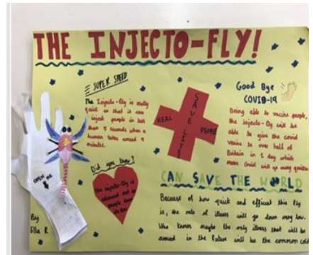
Juniors 2021 Winner Age 8-11