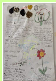
Sofia Panthers Infant Category