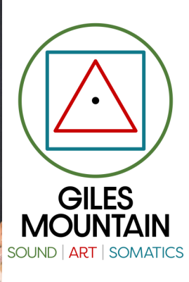
If you would like to learn more, visit: www.gilesmountain.com