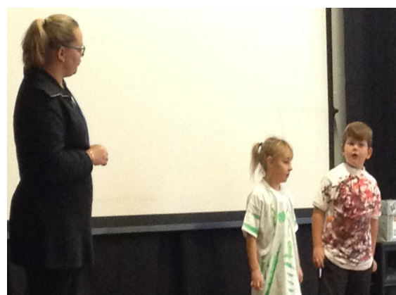
Year 2 held a fashion show today, here are a couple of their amazing t-shirt designs