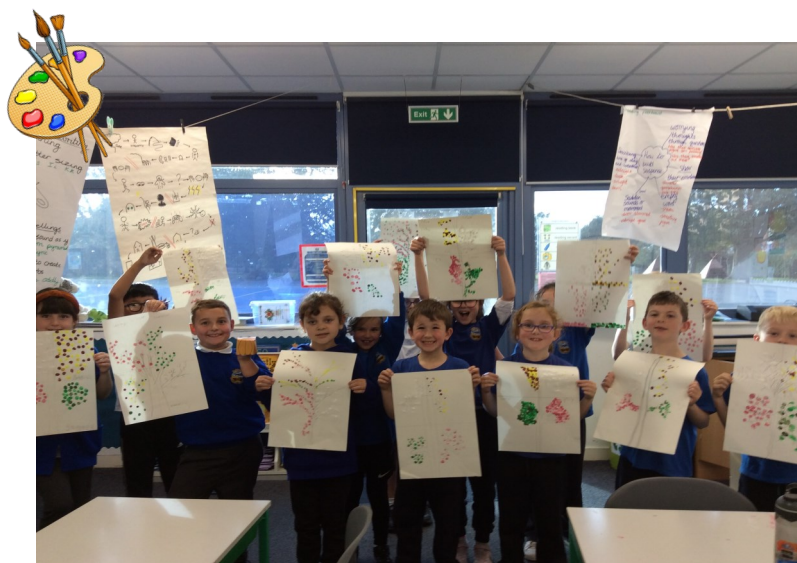
Miss Cable's Art Club during Term 4