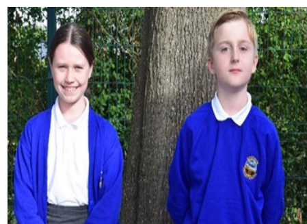
Saoirse (Gorillas) and Hugo (Eagles) Courtesy