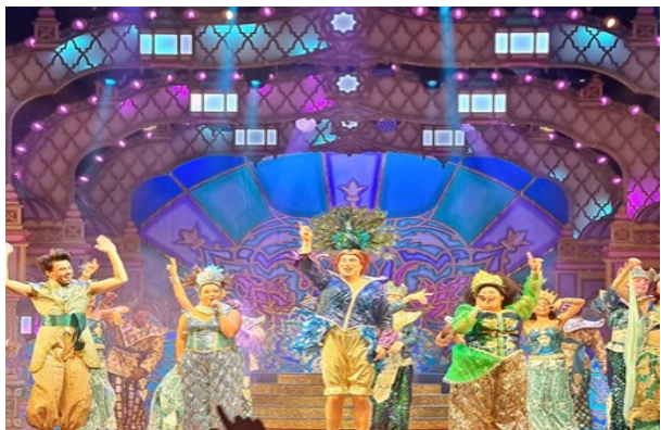
Aladdin at The Marlowe