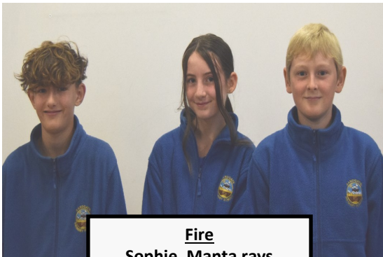
Fire Sophie, Manta rays Edward, Gorillas Frankie, Manta rays