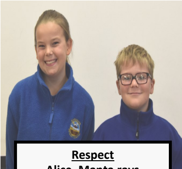
Respect Alice, Manta rays Harry, Gorillas