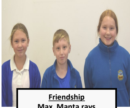
Friendship Max, Manta rays Lily, Gorillas Avaya, Gorillas