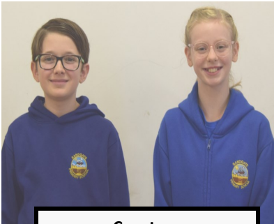
Courtesy Stanley, Gorillas Delilah, Gorillas