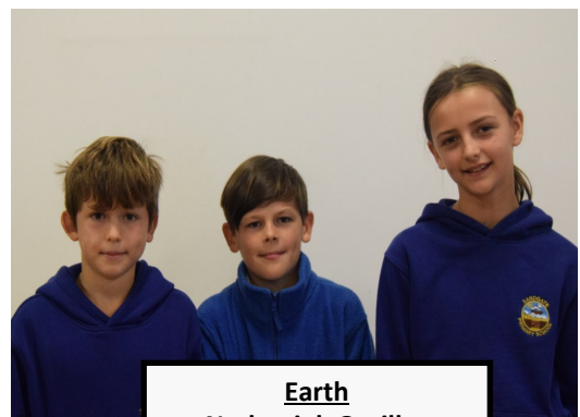
Earth Nathaniel, Gorillas Otto, Gorillas Mae, Manta rays