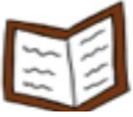
Once upon a time

Story map example: You could use these prompts to help you if you want to make up your own story: