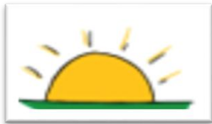
Early one morning